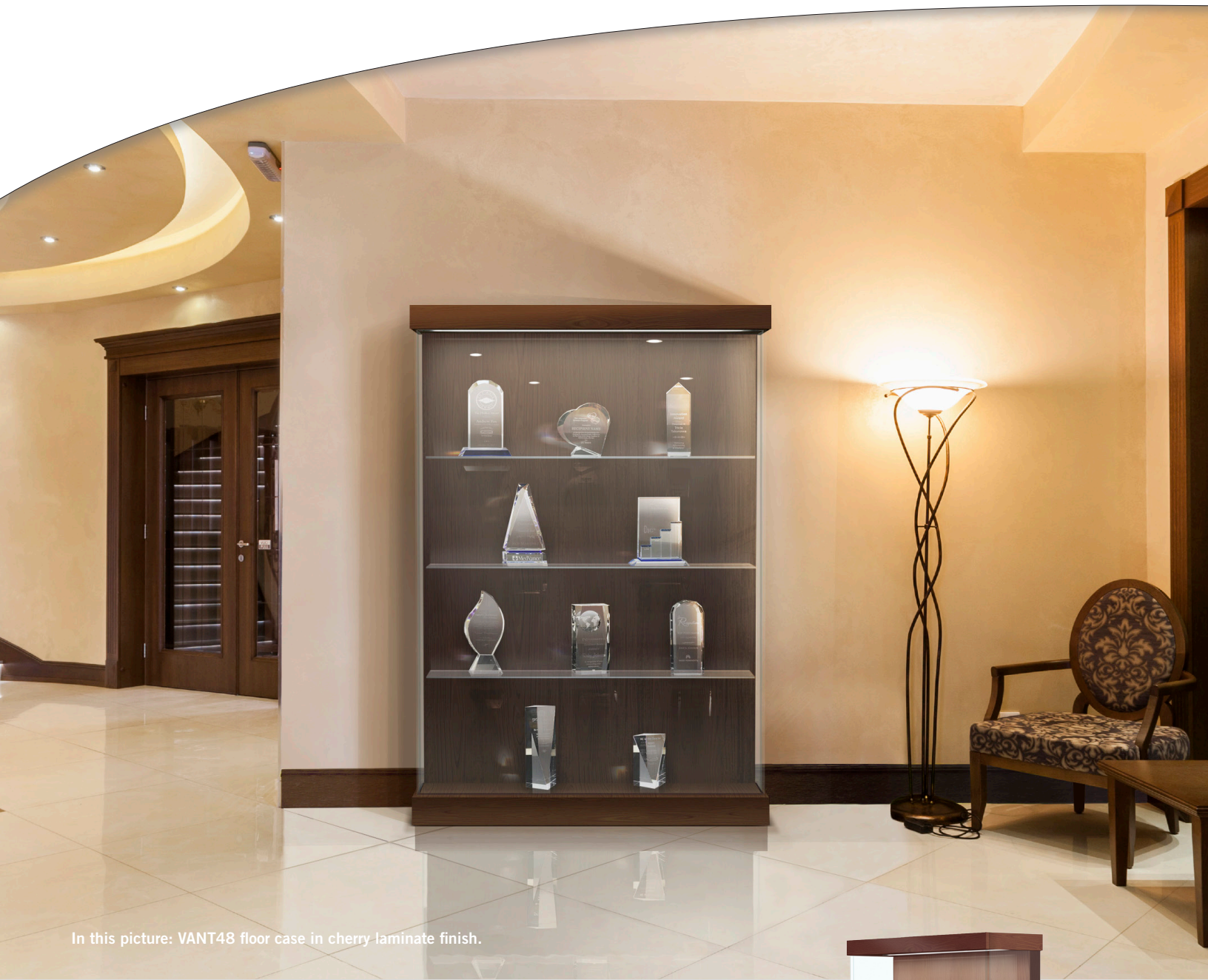
In this picture: VANT48 floor case in cherry laminate finish.