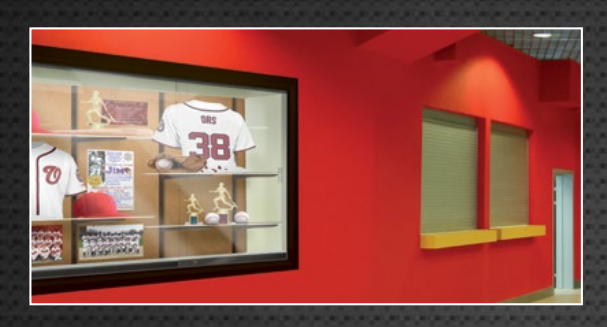
Built to Fit

When multiple boxes are utilized, a 2-1/4" spacer (wood) is provided for connecting the boxes side by side.