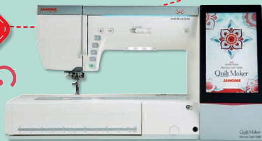
Horizon Quilt Maker MC15000

o For full details of embroidery machines visit janome.co.uk