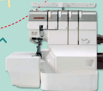
Air thread 2000D

o For full details of machines in this Overlocker range visit janome.co.uk