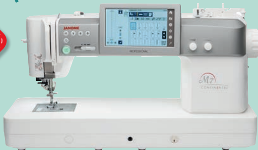
Continental M7 Professional

o For full details of machines in this Computerised long-arm range visit janome.co.uk