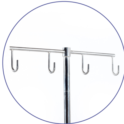
Four U shaped hooks