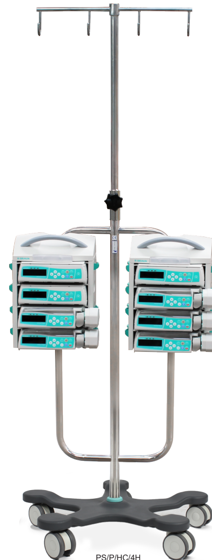
PS/P/HC/4H (pumps not included)