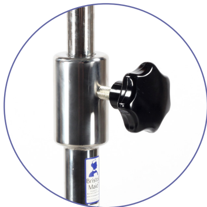
Height adjustable upright using a heavy duty handwheel