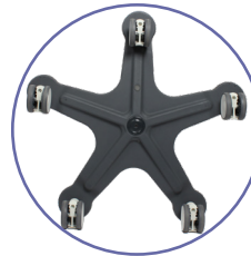
Smooth edges & contours, allows easy & effective cleaning