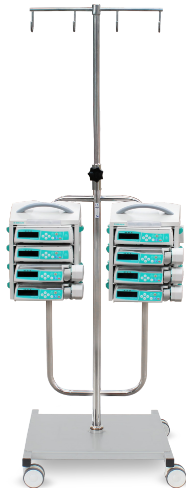
PS/P/HC/4H (pumps not included)