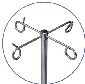
4 hook pole supplied with models with '4H' product code suffix