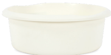
2PLCO054 7 Litre Polythene Bowl