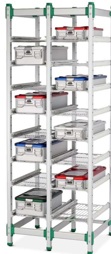
4HH-SCS/S2/16W Shown with B Braun Aesculap Sterile Containers (not supplied)