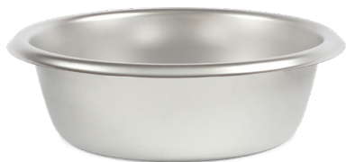
2MECO079 7 Litre Stainless Steel Bowl