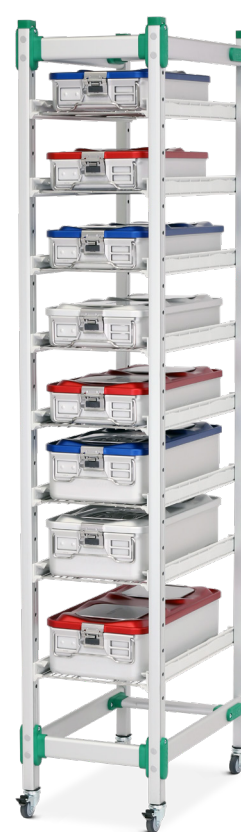
4HH-SCS/M51/8W Shown with B Braun Aesculap Sterile Containers (not supplied)