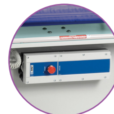
Rechargeable battery located at the rear of crib