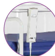
Supplied with a handset