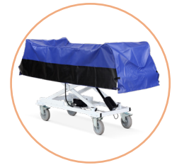
Shown with VH/950