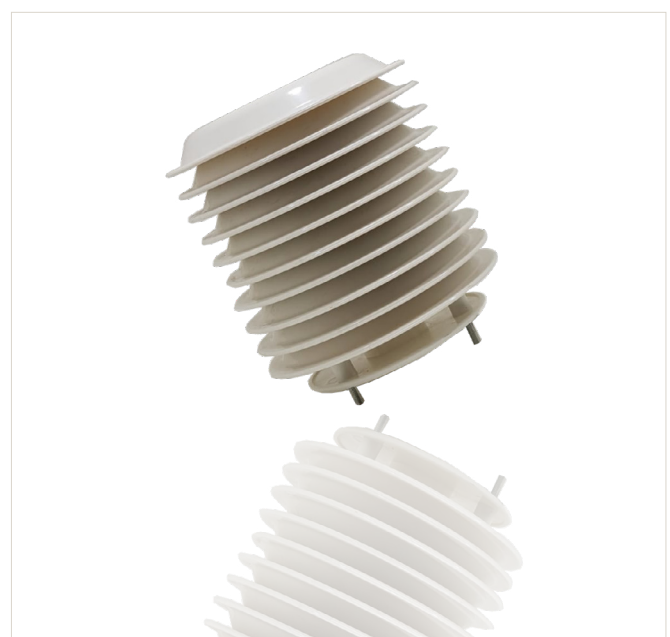
***Optional weather shield in image for illustration