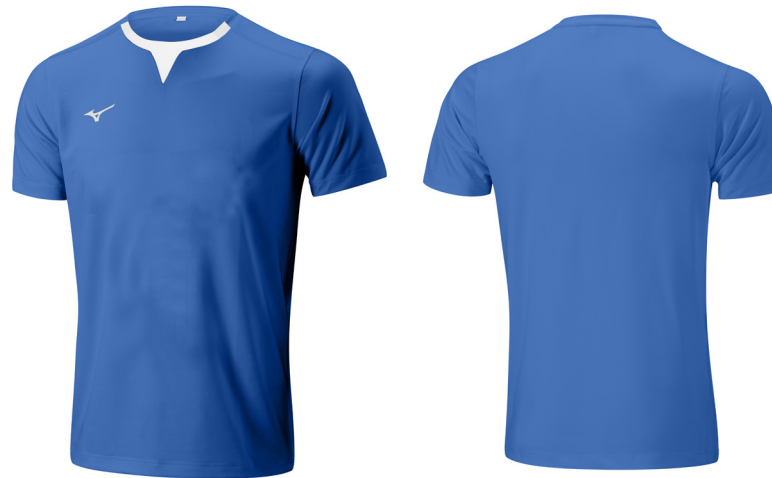
28 Royal Blue