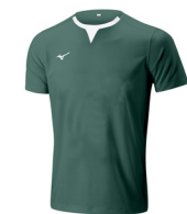
17 Bottle Green