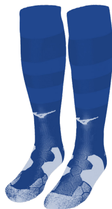
28 Royal Blue