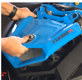
FIG 1 - Remove Hood

Pop off fascia cover hood ( FIG 1 ). Disconnect connectors on headlights and running lights ( FIG 2 ). Use T30 torx driver to remove 12 bolts holding on front clip. There are two bolts on each side (note that one of the bolts on the passenger's side of the unit is behind the fuel door) and two bolts underneath each side. For the bolt on each side of the unit that is near the headlights, use a 10mm socket/wrench to hold the nut on the underside of the plastic ( FIG 3 ). There are two bolts on top of the radiator and two bolts on the front of the clip. Remove the headlight adjustment bolt, using either an 8mm socket or a T20 Torx driver, depending on your unit ( FIG 4 ). There are plastic clips still holding the front clip to the unit. You may be able to gently pull the front clip off, or you may need to use a screwdriver to pry the clips off ( FIG 5 ). Remove front fascia. Remove clip nuts from stock bumper and set aside ( FIG 6 ).