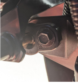
FIG 4 - Headlight Adjustment Bolt - 8mm