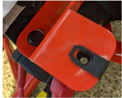
FIG 11 - Radiator Bolt and Clip Nut Installed On Bumper Bracket

Cut Zip-tie and use previously removed hardware to reinstall radiator. The bottom of the radiator will bolt to the underside of the bumper bracket ( FIG 11 ). Snap previously removed clip nuts onto bumper bracket ( FIG 11 ). Replace and reinstall front fascia.