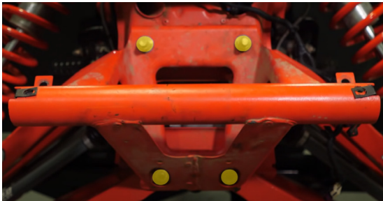
FIG 9 - Remove Stock Bumper/Bulkhead - 18mm

Use 18 mm sockets/wrenches to remove hardware holding stock bumper/bulkhead to forward arms. Remove stock bumper/bulkhead ( FIG 9 ).