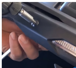
FIG 3 - Side Bolt - T30, 10mm