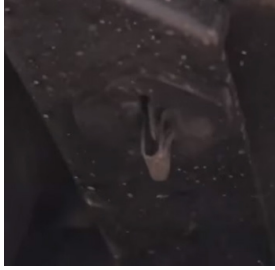
FIG 5 - Remove Clips