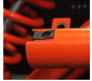
FIG 6 - Remove Clip Nuts