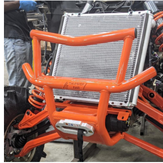
FIG 10 - Installed Bumper

Install Thumper bumper/bulkhead using previously removed stock hardware. Tighten using 18mm sockets/wrenches ( FIG 10 ). If you have a winch, install it and fairlead at this time. Refer to your winch manufacturer for wiring/mounting instructions.