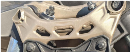
FIG 7 - Remove Radiator Bolts - 13mm

Use 13mm sockets/wrenches to remove radiator hardware( FIG 7 ). Zip-tie radiator out of way( FIG 8 ).