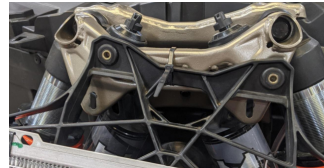
FIG 8 - Zip-tie Radiator