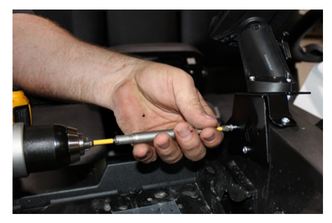
FIG 2 - Fasten Dash Mount Plate to dash using Drill

Drill hole using 1/2" drill bit & run wires through hole. Fasten wireless phone charger (2) and dash mount plate (1) to dash, using a drill and 5 X #14 x 3/4" truss head phillips screws (A), careful not to over tighten. Refer to wiring instruction inside wireless phone charger box. ( FIG 2 ).