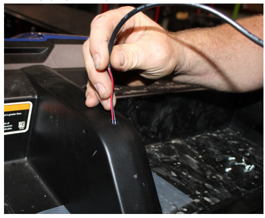
FIG 1 - Fasten Wireless Phone Charger to Dash Mount Plate using 1/8" Allen Wrench and 5/16" Wrench

Run phone charger wires through center hole of mounting plate and use 3 \times \#6-32 \times 1 " socket cap screws ( B ) 3 \times \#6-32 \times 1 Nylon Insert Lock Nut ( C ) 3 \times \#6 Washers ( D ) to fasten wireless phone charger ( 2 ) to the dash mounting plate ( 1 ) ( FIG 1 ).