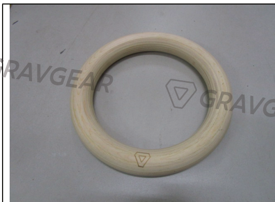
Sample before test (Static Tension for the Ring)