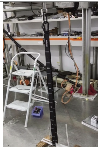
Sample during test (Locking strength of buckles)