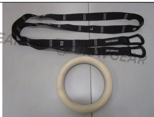
Sample before test (Integrated Loading Test)