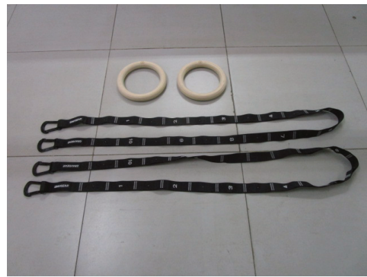
Sample as Received