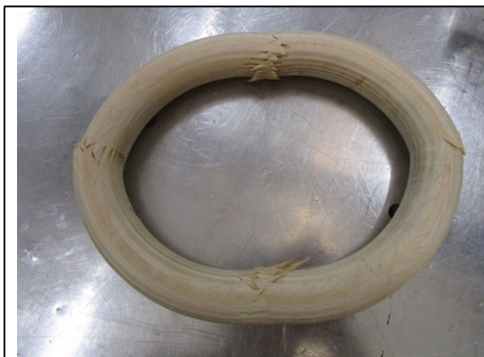
Sample after test (Static Tension for the Ring)