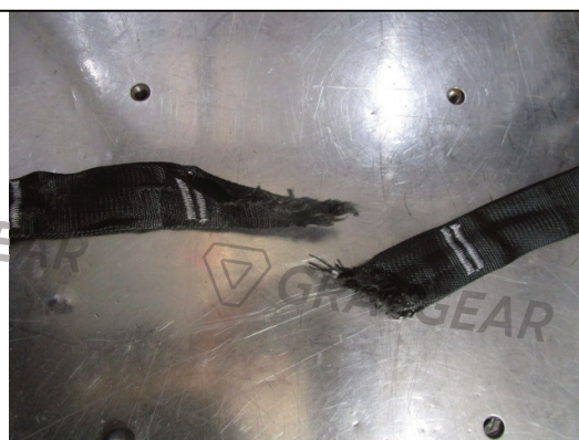
Sample after test (Static Tension for the Strap)