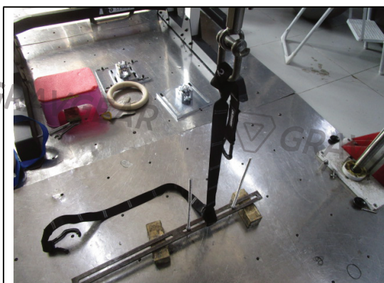
Sample during test (Static Tension for the Strap)