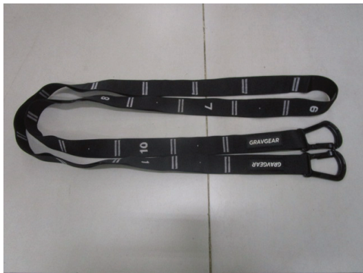
Sample before test (Locking strength of buckles)