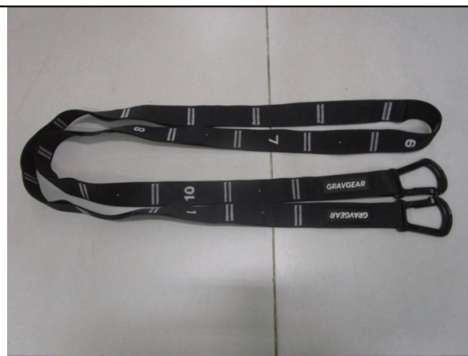
Sample before test (Static Tension for the Strap)