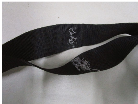
Sample after test (Integrated Loading Test)