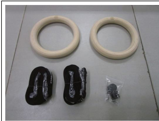
Sample as Received