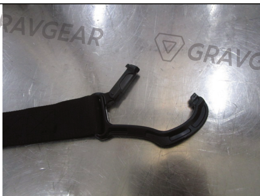
Sample after test (Locking strength of buckles)