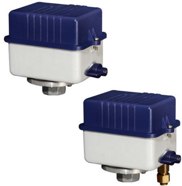
Fig. top: Pressure switch mechanical, model PSM-530