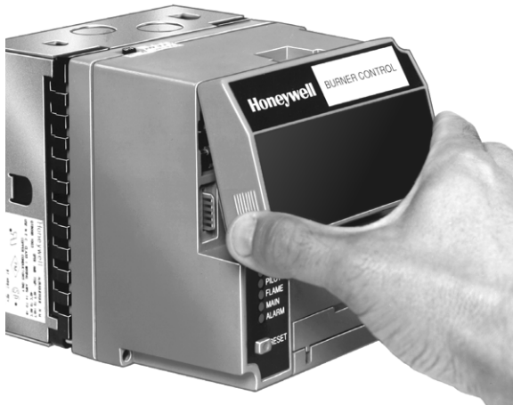
Fig. 2. Mounting Remote Reset Module.

The S7820A Remote Reset Module mounts directly on the Relay Module.