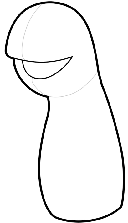
Alternate Body Pattern

Character design is the single most important step in producing professional-quality puppets.