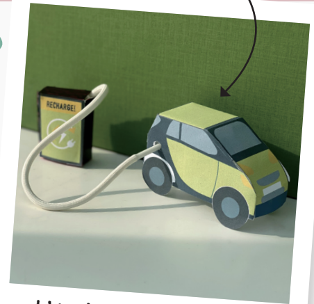
Here's one we made!

Share your creations with us! #tenderleaf f i p t