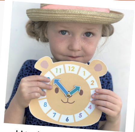
Here's one we made!