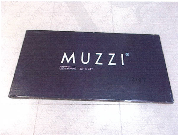
Photo of Samples