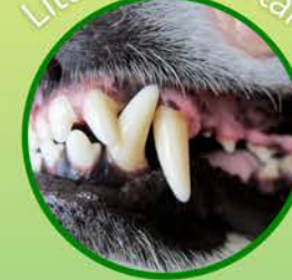
Little to no tartar