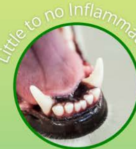
Little to no inflammation

CLEAN TEETH • FRESH BREATH • HEALTHY, PAIN FREE GUMS