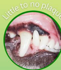
Little to no plaque