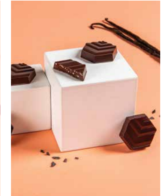
SMOKED SALTED CARAMEL