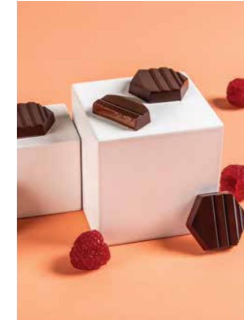
SUMMER BERRIES CARAMEL