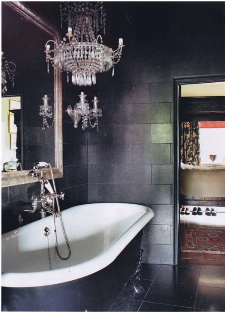
Above: a 19th-century Empire-style glass chandelier hangs over an enameled cast-iron roll-top tub in the master bathroom, which also contains fine English cut-glass wall sconces and a large 19th-century gilt-framed French mirror. Opposite: above the dressing room's chequered floor hangs a 1920s continental beaded-glass chandelier, reflected in the mirrors of the newly built, Rivière-designed fitted cupboards. Beside the daybed, which was upholstered in antique silk fabric by Clarke & Reilly, stands a japanned tripod table