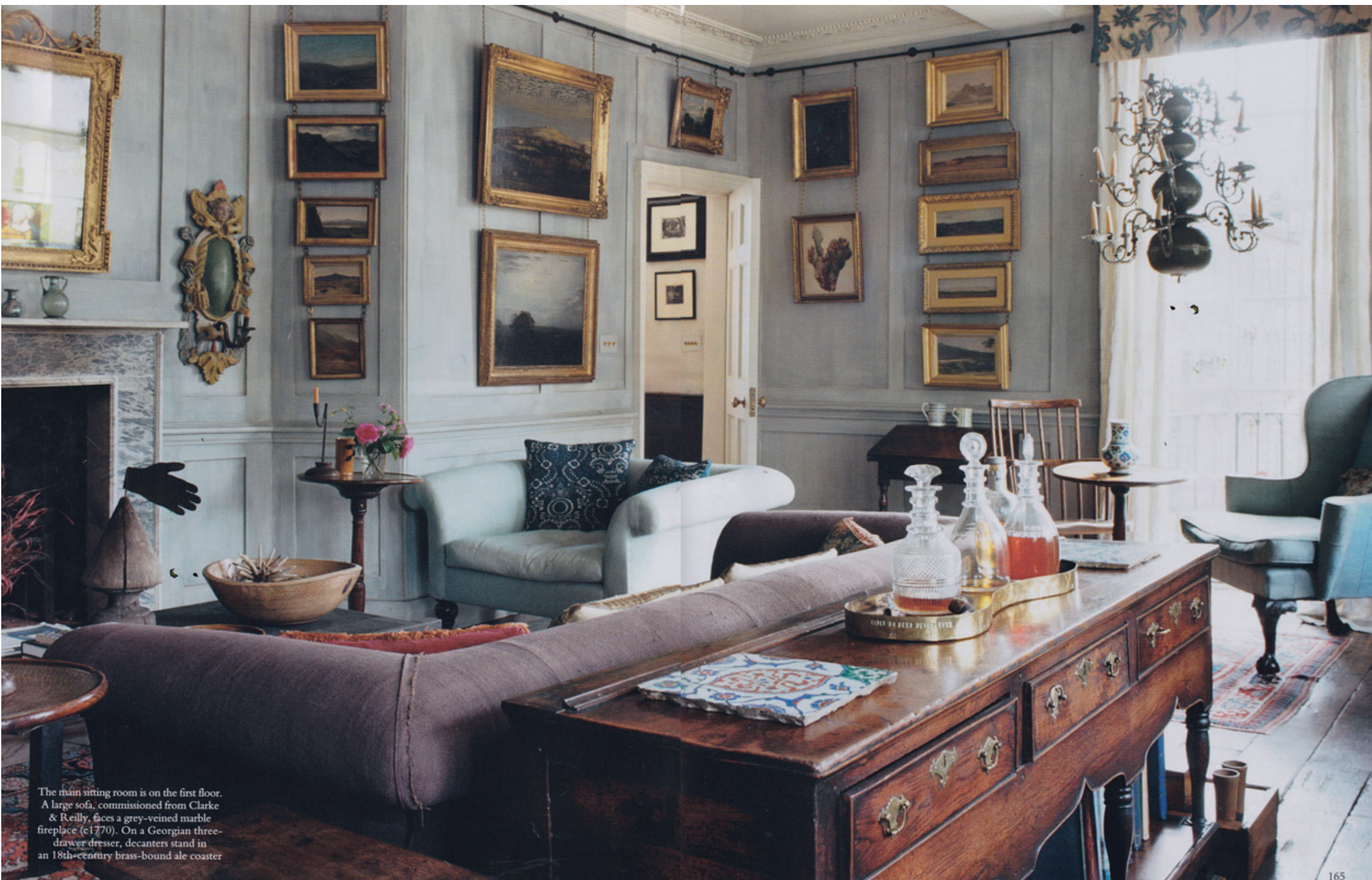
The main sitting room is on the first floor. A large sofa, commissioned from Clarke & Reilly, faces a grey-veined marble fireplace (c1770). On a Georgian three-drawer dresser, decanters stand in an 18th-century brass-bound ale coaster