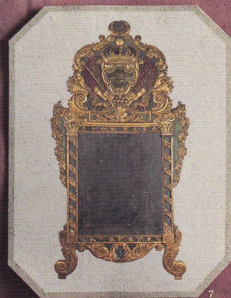
1 White/red/blue 'Chintamani' (rpt: 12.5 x 24cm), by Ottonline, £158; 2 Ocean 'Penelope' (rpt: 45.3cm), £166; both The Fabric Collective. 3 Plate, by Idarica Gazzoni, £530 approx for four, Arjumand's World. 4 Red/green embroidered 'Mingora' (rpt: 39cm), £140, Vaughan. 5 Ruby 'Victoria' (rpt: 109 cm), £230, De Le Cuona. 6 'Noor NOOR-02' (rpt: 8 x 19 cm), by Namay Samay, £170, Tissus d'Hélène. 7 Rare late 18th-century Ottoman mirror, $285,000 for the pair, Carlton Hobbs. Fabric prices are per m; all prices include VAT. For suppliers' details see Address Book >