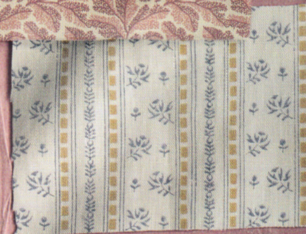
1 'Phaselis 176-01' (rpt: 18cm), £128, Nicholas Herbert. 2 'Devon SSTDEV-07' (rpt: 8 x 8.9cm approx), by Schuyler Samperton Textiles, £303.60, Tissus d'Hélène. 3 'Cushion' chair, from £3,400, Soane Britain. 4 Indigo 'Petite Fleur' (rpt: 4cm), by Pukka Fabre, £175.20, Tissus d'Hélène. 5 British polychrome spongeware cawl bowl, c1880, £160, Robert Young Antiques. Fabric prices are per m; all prices include VAT. For suppliers' details see Address Book >