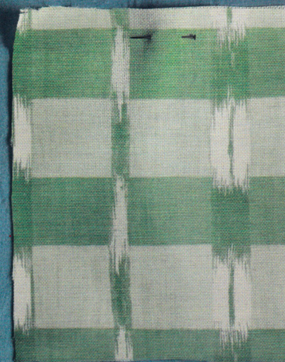
1 Lavender 'Poleng' (rpt: 10.2cm), by Raoul Textiles, £256.20, Turnell & Gigon. 2 Soldier's Valentine , pen, ink and watercolour on paper, c1830, £3,500, Robert Young Antiques. 3 Staffordshire jug with lustre decoration, c1790, £875, Robert Kime. 4 Sulphur 'Poleng' (rpt: 10.2cm), by Raoul Textiles, £256.20, Turnell & Gigon. 5 'Marla J0118-05' (rpt: 14 x 35cm), by Jane Churchill, £59, Colefax & Fowler. 6 Ladderback armchair, £3,300, Howe. 7 'Camden 773-20' (rpt: 8cm), by Schumacher, £108, Turnell & Gigon. 8 'Elmer 7940-03' (rpt: 2 x 2cm), £35, Romo. 9 Thyme 'French Ikat FIK-01' (rpt: 29.9 x 21.9cm), by Carolina Irving, £126 approx, Tissus d'Hélène. Fabric prices are per m; all prices include VAT. For suppliers' details see Address Book >