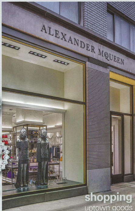
shopping uptown goods