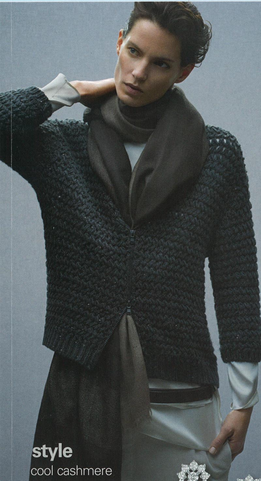
style cool cashmere such sparkle