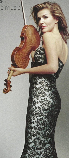
arts magic music