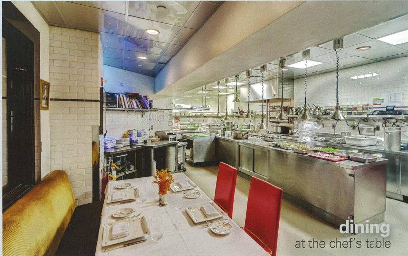
dining at the chef's table