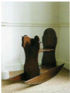
Above: Primitive rocking horses, c1820, with provenance, £2,500, Robert Young Antiques.

Primitive English Windsor and ladder splat back armchair, c1800, £2,200, large stool (oak stick stool, c1800), £180, both Robert Young Antiques.