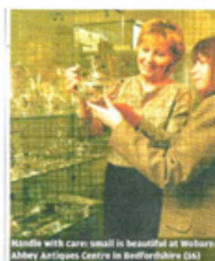
Handle with care: small is beautiful at Woburn Abbey Antiques Centre in Bedfordshire (16)