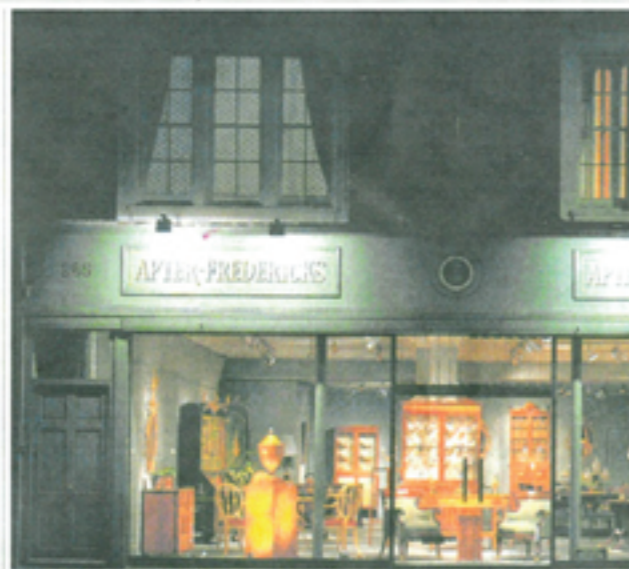
Obscure objects of desire: family business Apter-Fredericks has been selling refined English furniture for more than 60 years (4)