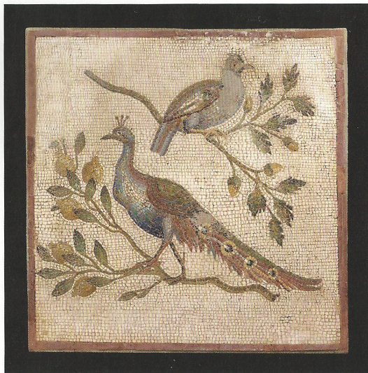
Above: a Roman marble and glass tesserae mosaic depicting a peacock on a fruiting lemon tree branch and a wood pigeon on an oak branch, beginning of the 2nd century, 2ft 7in (78cm) square – €180,000 from Galerie Chenel .