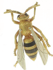
Above and below: a pair of Hermès wasp brooches in black onyx, yellow and white gold, Paris c.1970 – £9850 from Hancocks .