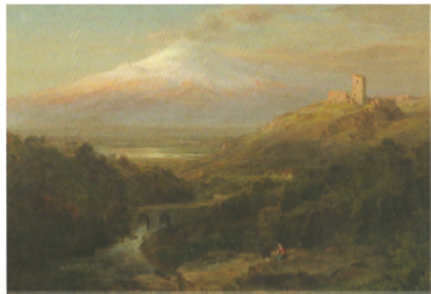
Above: View in the Andes, Mount Chimborazo by Frederic Edwin Church (1826-1900), oil and canvas signed and dated 1880, 15 x 22in (38 x 56cm) – $4m from Collisart .