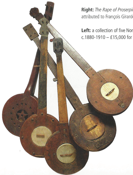
Left: a collection of five North American mountain banjos, c.1880-1910 – £15,000 for the group from Robert Young Antiques .