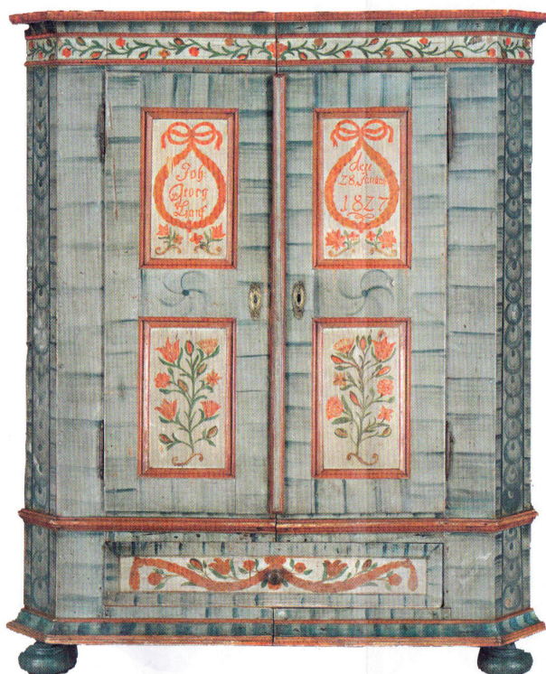
Below: folk art specialist Robert Young brings this marriage cupboard from northern Europe inscribed and dated 1827. It is painted and patinated pine with original hinges, escutcheons, lock and key, and is offered for £12,500 .