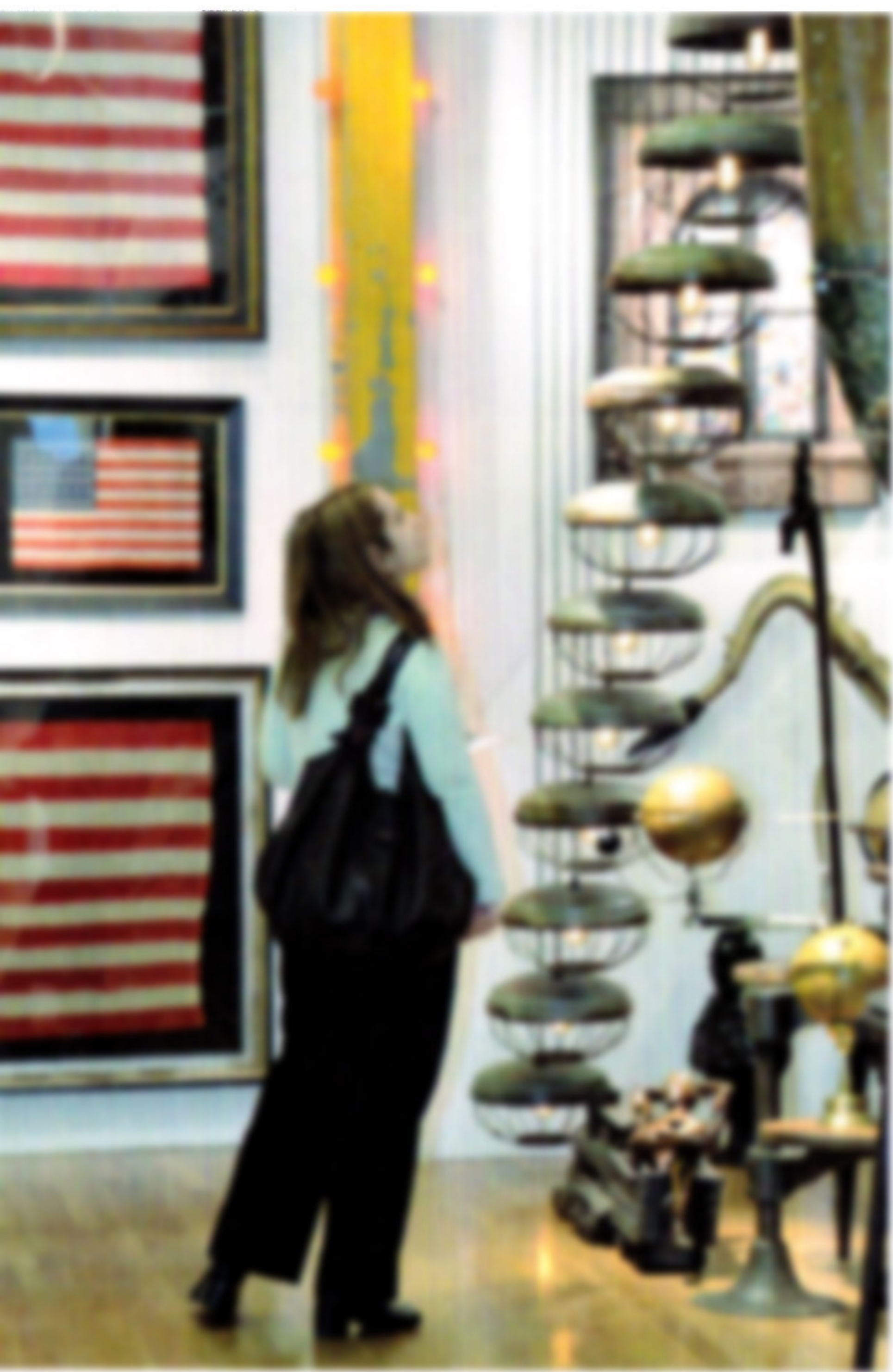
Above: browsing at the Metro Show – this year renamed Metro Curates (January 22-25) – see page 42 for more information