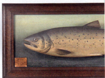
Reel in a buyer

Rare trout trophy is one of the big catches from dealers as part of BADA Week Page 44