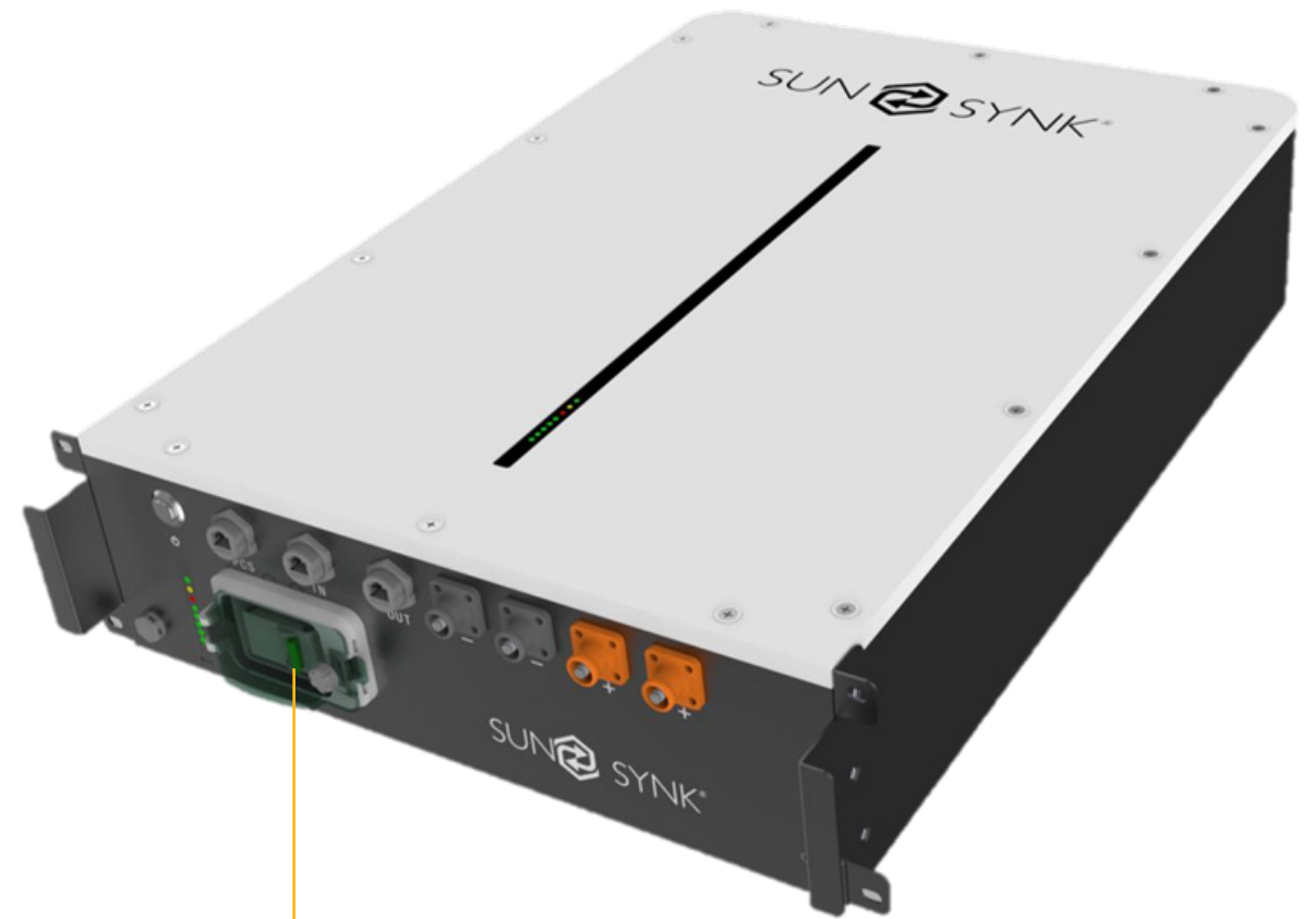
DC 125A Circuit Breaker

[3] The warranty is due whichever reached first of warranty period or energy throughout.