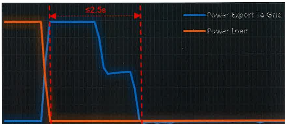
Figure 2. Control Result