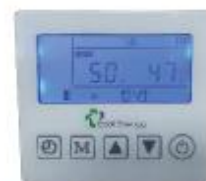
Intelligent touch screen WIFI controller

Specifications subject to change without warning.