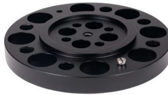
Mitchell Male Plate