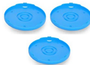
3 x Dust Covers