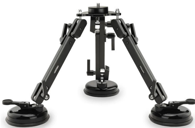
Proaim Horizon Car Mount

Please inspect the contents of your shipped package to ensure you have received everything that is listed below.