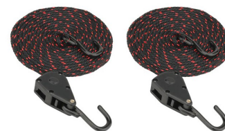
2 x Ratchet Belts