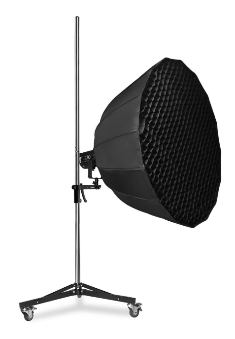
(SHOWN WITH OPTIONAL ACCESSORIES)

Warranty: We offer one year warranty for our products from date of purchase. Within this period of time, we will repair it without charge for labor or parts. Warranty doesn't cover transportation costs nor does it cover a product subjected to misuse or accidental damage. Warranty repairs are subjected to inspection and evaluation by us.