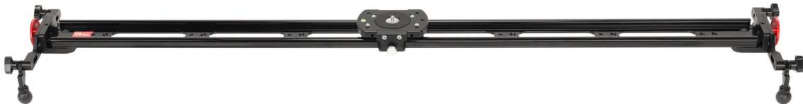
Proaim Zeal 4ft Slider

Please inspect the contents of your shipped package to ensure you have received everything that is listed below.