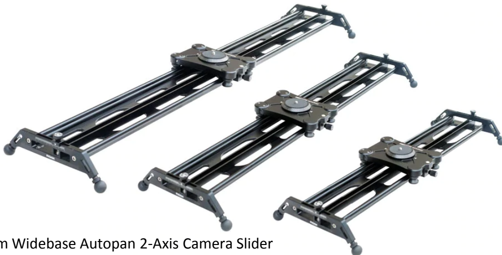
Proaim Widebase Autopan 2-Axis Camera Slider

Please inspect the contents of your shipped package to ensure you have received everything that is listed below.