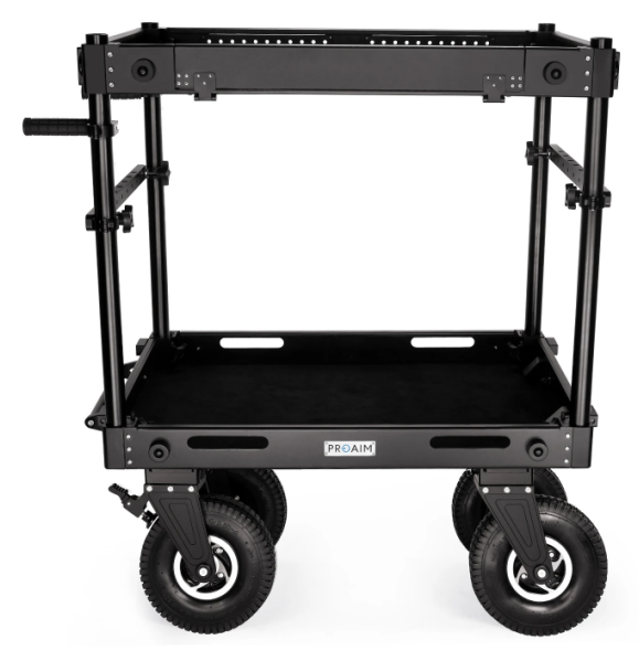
Available Sizes: 36" 42