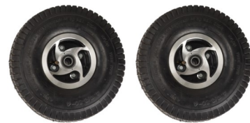
2 x Pneumatic wheels