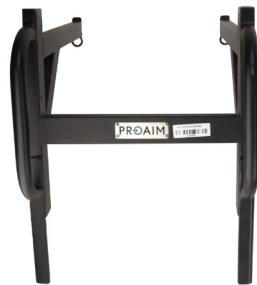
1 x Top Part of Cart