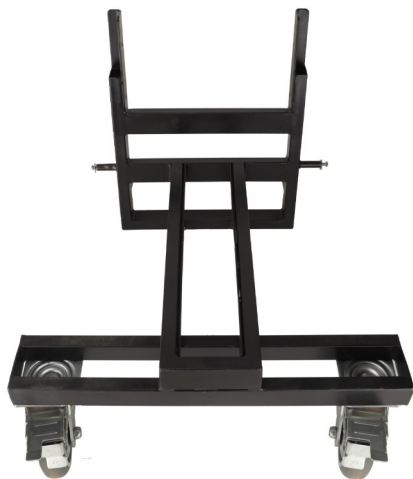
1 x Base Part of Cart

Please inspect the contents of your shipped package to ensure you have received everything that is listed below.