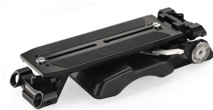
Proaim SBP-01 VCT Shoulder Base Plate

Please inspect the contents of your shipped package to ensure you have received everything that is listed below.