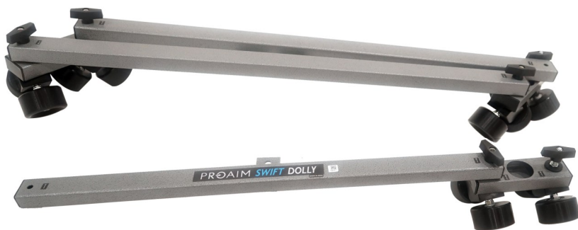
Swift Dolly with Wheels attached

Please inspect the contents of your shipped package to ensure you have received everything that is listed below.