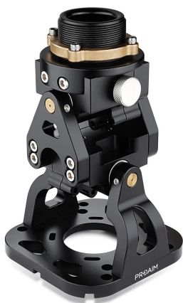
Proaim Sway Control Friction Levelling Head

Please inspect the contents of your shipped package to ensure you have received everything that is listed below.