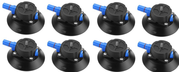
8 x Suction Grippers