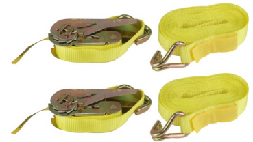
2 x Safety Belts