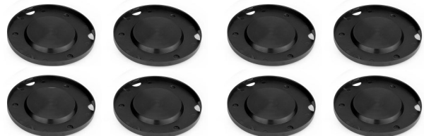
8 x Dust Covers (Black)