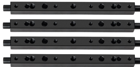
4 x Arms