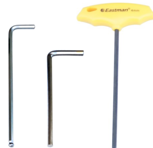
3/16", 3mm, 4mm Allen keys