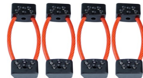
4 x Red Wires