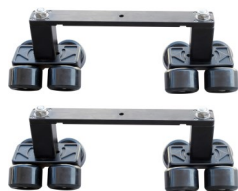
Proaim Track Wheels for Spin Dolly (SPN-TRK-WS)