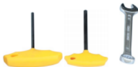
4mm 10mm 13mm