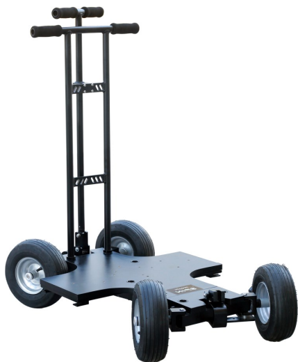
Proaim Spin Doorway Dolly

Please inspect the contents of your shipped package to ensure you have received everything that is listed below.