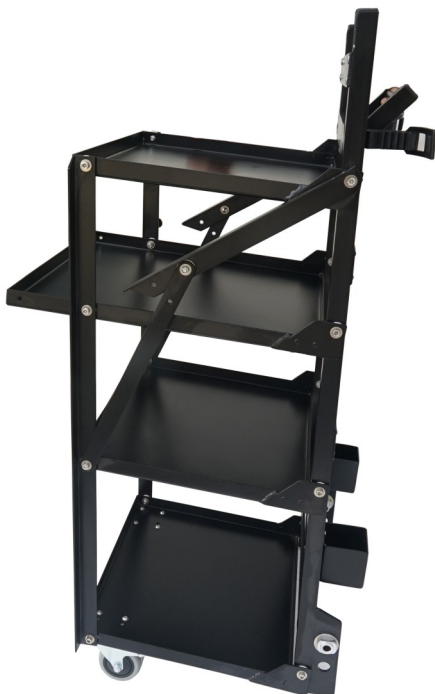
Proaim Soundchief Lite Cart

Please inspect the contents of your shipped package to ensure you have received everything that is listed below.