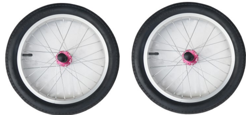
2 x 16" Quick Release Wheel