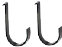
2 x Cable Hooks