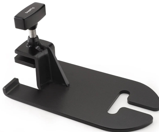
Proaim SnapRig Quick Reverse Ear GP205 for 1" Square Tube

Please inspect the contents of your shipped package to ensure you have received everything that is listed below.