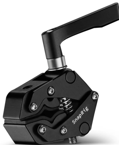
Proaim SnapRig Mini Super Clamp

Please inspect the contents of your shipped package to ensure you have received everything that is listed below.