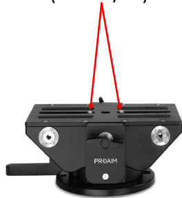
Rocker Plate System