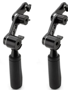
2 x Handles